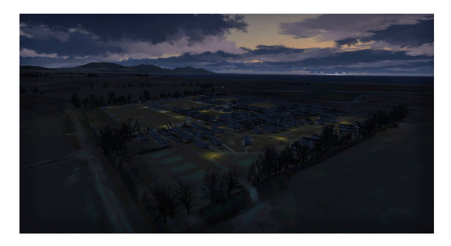
Air Guardians Offline Activation Code And Serial